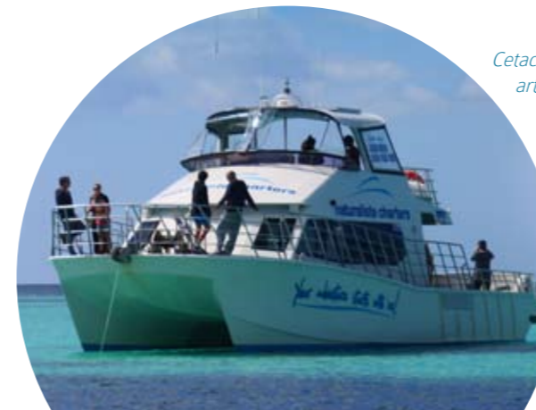
Cetacean Explorer: a state of the art 55ft vessel purpose built for whale watching with three viewing areas: a spacious lounge area with seating for 30, a huge foredeck and an upstairs flybridge with 360 degree views for an exhilarating whale watch. Complete with on board hydrophone to listen to the whales!