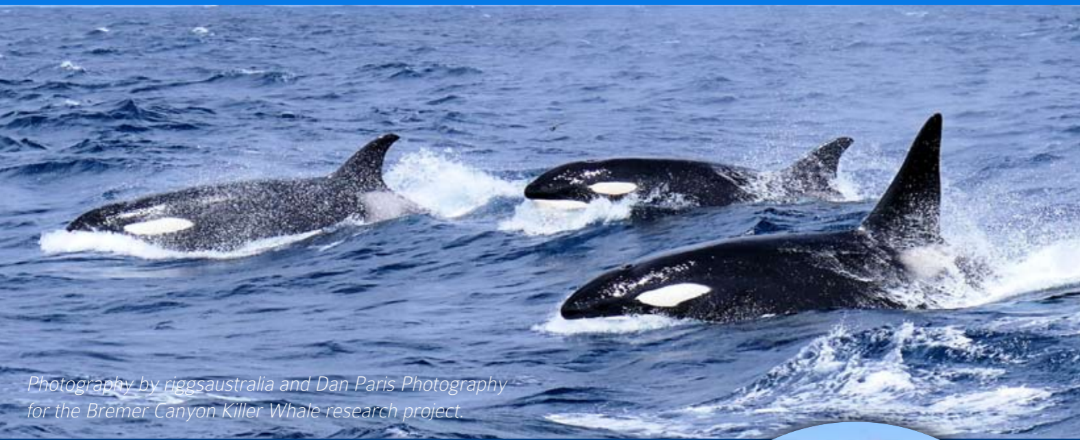
Photography by riggsaustralia and Dan Paris Photography for the Bremer Canyon Killer Whale research project.